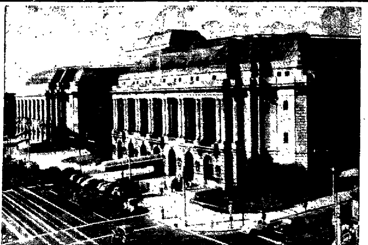
TWIN BUILDINGS TO HOUSE CONFERENCE—Trucks in front of the San Francisco War Memorial, the Veterans building (foreground), are unloading furniture for use of delegates and press attending the San Francisco United Nations Conference which will be housed in that building and the Opera House (background).

The Roosevelt desk and all the mementos and gadgets were offered to Mrs. Roosevelt by the president and she has accepted it. It will be placed in the Roosevelt library at Hyde Park. The new Truman desk is one first used by Theodore Roosevelt and successively by five other presidents—Taft, Wilson, Harding, Coolidge, and for a time by Herbert Hoover.