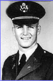
Photo In Uniform