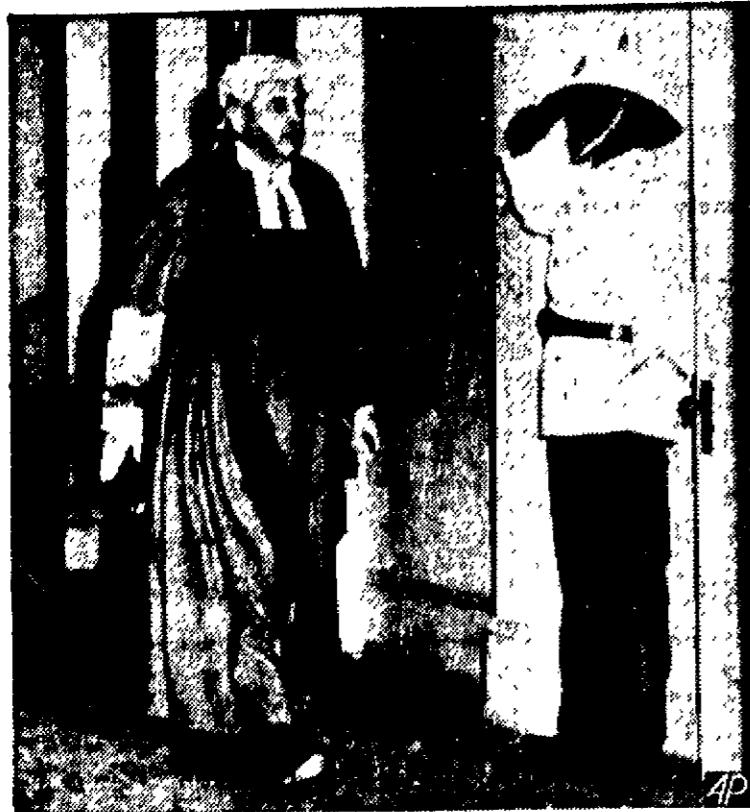
In scarlet robe and white wig in the British custom, Chief Justice Sir Oscar Bedford Daly approaches guarded door to the courtroom in Nassau, Bahamas, where Alfred De Marigny went on trial on a charge of slaying his father-in-law, Sir Harry Oakes.