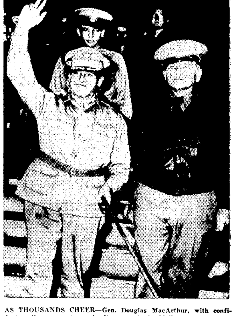
dent smile, waves to applauding crowds in Melbourne, Australia. At right is Brig. Gen. Patrick Hurley, former secretary of war, now U. S. minister to New Zealand.