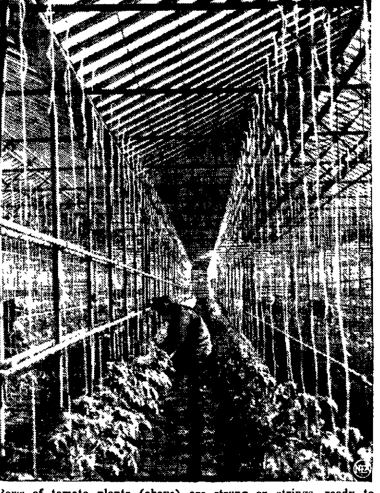
Rows of tomato plants (above) are strung on strings, ready to grow to a height of 10 feet and produce fruit from the ground up to almost the top of the plant in Cleveland's glass-covered "super-Victory Gardens." Below, a horse-drawn drag breaks up plowed soil in one of Cleveland's Ruetenik Gardens greenhouses.

house "climate." Temperatures vary according to available sunlight. Greenhouse floors are covered with tile, through which steam is shot to sterilize the 36-inch layer of soil