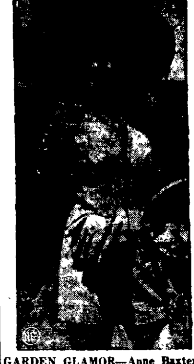
GARDEN GLAMOR— Anne Baxter, in shirt and sun suit, proves Hollywood victory gardens are sprouting both vegetables and glamor this year.

New York —(P)—Ann Corio, who has reached a degree of prominence as a striptease, has turned author. She is putting the finishing touches on a book of verse dealing with her views on men, life, and the drama. The title: "Revealing Lines."