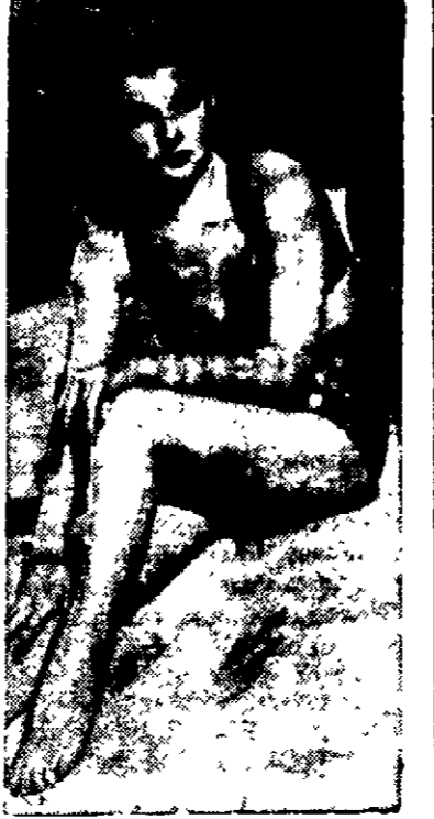
ANN TANS— This beauty at the beach is that attractive touch of Texas, Ann Sheridan, doing some sunning in Hollywood.