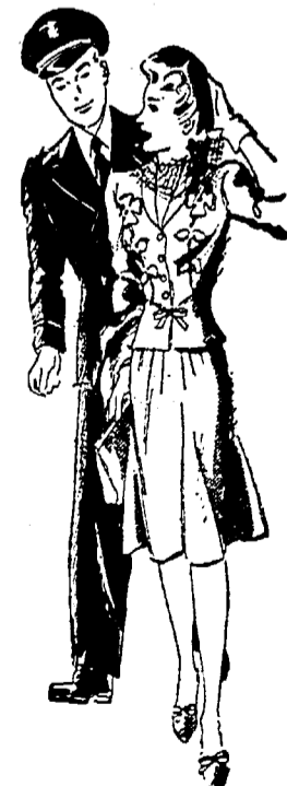
Vitality Open Road Shoes $5.50 and $6

Dancing at the USO, furlough dating, walking everywhere... look smarter, feel smarter in chic Vitality shoes. You'll wear them proudly off duty, don them regularly for their heavenly comfort on duty. More than ever in demand this spring!