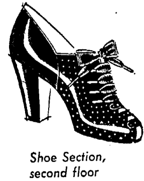
Shoe Section, second floor