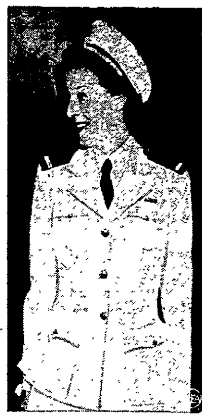
1 IN 100—Lone navy nurse to escape from Corregidor, Ann Agnes Bernatitus, in Washington, reveals there were about 100 women on the island when it capitulated.

George Aschenbrenner on the Indian reservation.